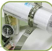
Pneumatic telescoping arm